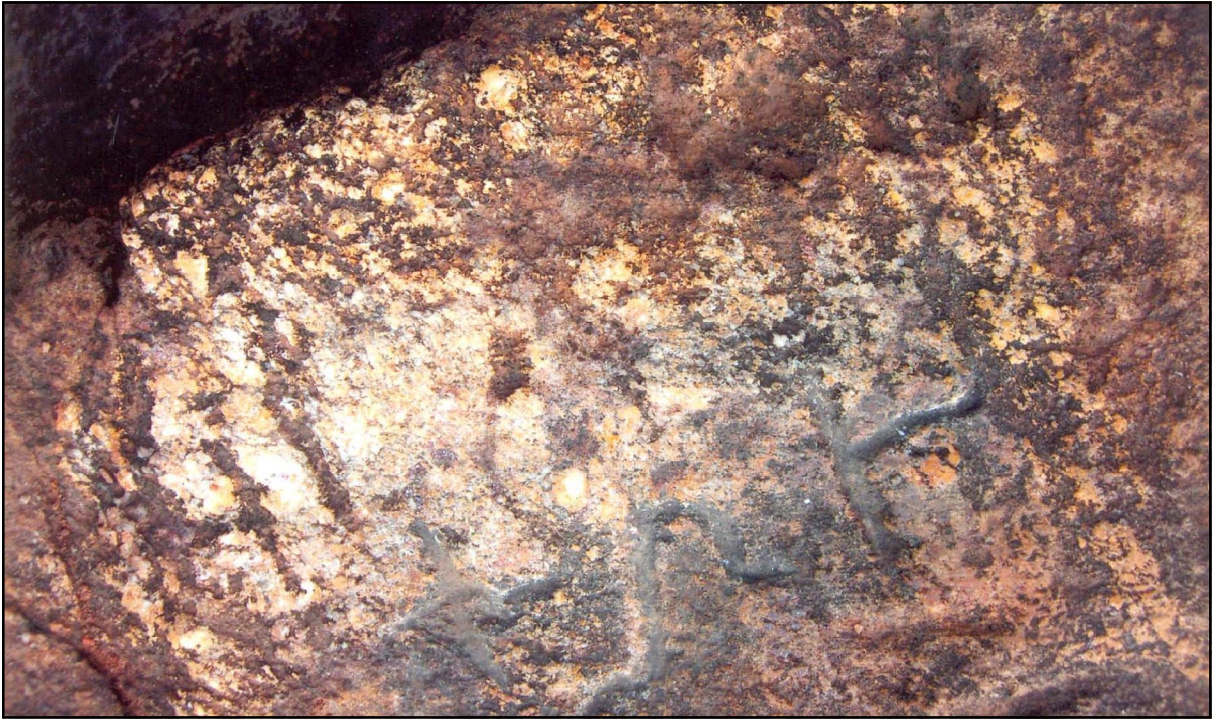
Inscription - Bhallika Lena

the Lord 'Arisa Pitha' (rice cake mixed with ghee and molasses) in a bowl provided by the four guardians of the directions (Lokapalas). After offering these gifts, Tapassu and Bhallika became the first lay disciples (Upasaakas) and received relics of Buddha's hair (eight handful strings of hair) and nails which the Tathagata offered them to enshrine in stupas in their home country. The merchant brothers carried home the divine relics to their native city Asitanjana where they deposited it in a magnificent Chaitya, erected for the purpose. According to the commentary of the Theragatha these two merchants also subsequently visited the Buddha at Rajagriha and by that time Tapassu was renamed as Sotapanna and Devachikaupasaka and his name has been incorporated in the list of eminent upasakas of Lord Buddha. On the other hand Bhallika joined the Sangha and became an arhat. The Pujavaliya