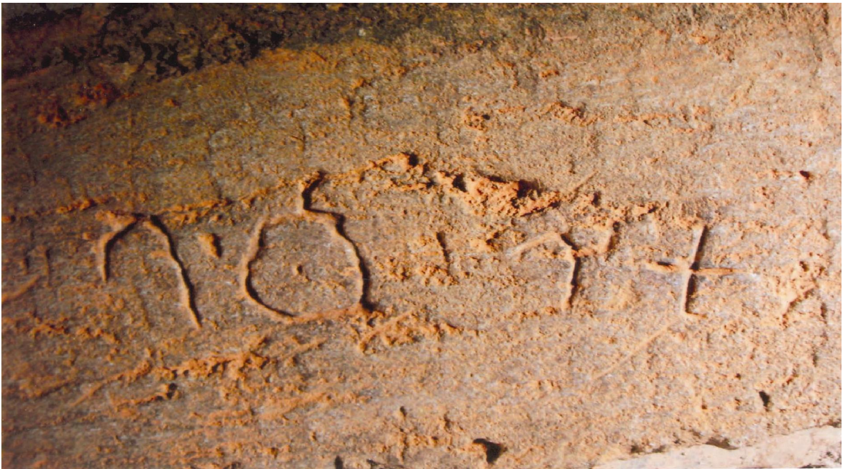
Inscription - Kesa Thupa